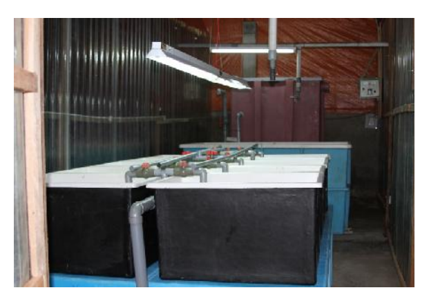
Experimental system for high temperature