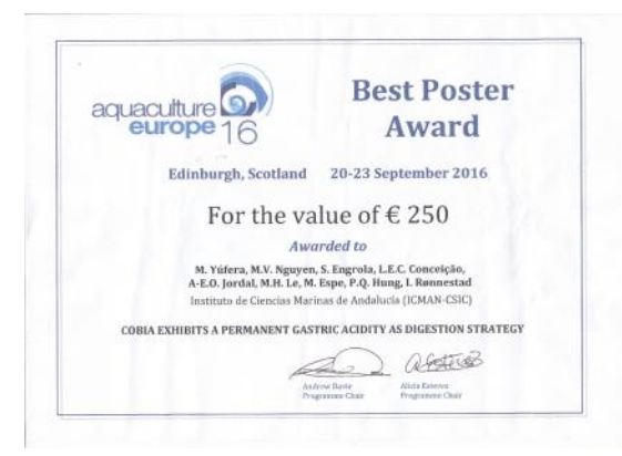
Best poster award related to Norhed project