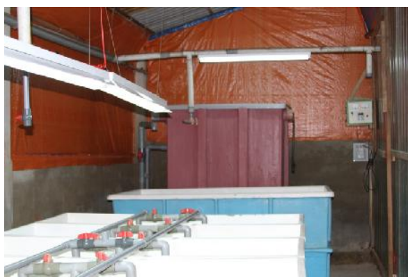
Experimental system for control temperature