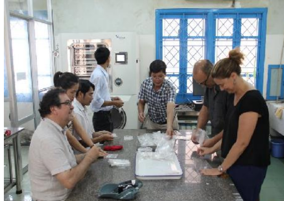
Samples of the experiment for package